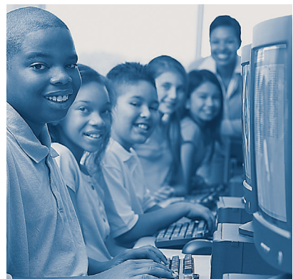
A TOOLKIT for College Students Volunteering with K-12 Youth